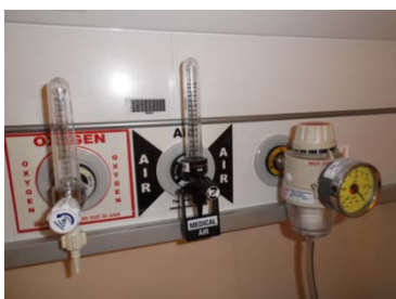
Figure 4: Only safer air flowmeters are now in use

The trust spent approximately £1,500 on implementing these changes in its 600-bed hospital.