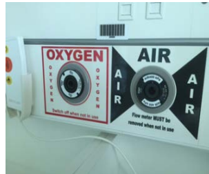
Figure 2: Example of a terminal unit warning label

Similarly to the use of flaps on medical air flowmeters, labels have a limited impact on reducing human error when implemented on their own. They can however be effective if used in combination with other approaches as they help to differentiate between different gas outlets.