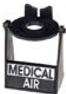
Figure 5: Medical air flowmeters are fitted with a labelled, movable 'guard' that covers the tubing connection to raise awareness of gas selected (left) and air blanking plugs are fitted to all outlets not in use