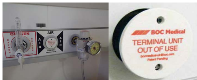
Figure 3: Air outlets have been locked in some areas

Medical air terminal units in ITUs, theatres and other critical care areas were not capped as these still use piped air for ventilators and other equipment. For certain wards where medical air terminal units are still used (eg respiratory wards), flowmeters have been purchased with a flap/shield/guard. These are labelled 'medical air' and as this lettering is larger than on the flowmeter itself, it is easier to differentiate between air and oxygen flowmeters. Also, when attaching a tube the flap needs to be lifted, which is an additional step to remind the user that they are designed for a different gas supply.